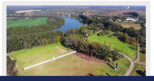
LEARN MORE ABOUT PRO REGNO HERE